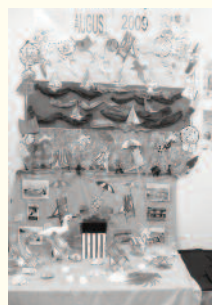
Pictured here is the Summer Display. They talked about holidays and summer, and what holidays were like for them. Making the display was a whole team event.