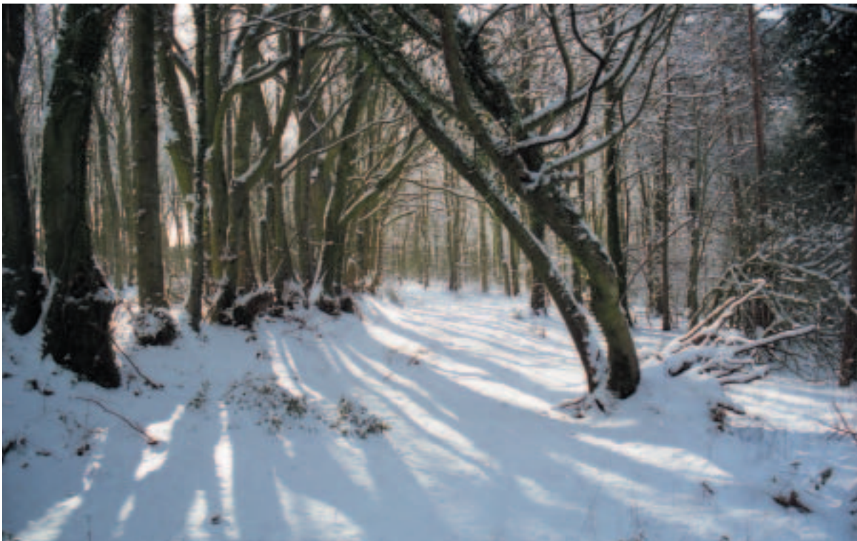
We would like to thank Blandford Camera Club, for allowing us to use this photograph.

Our new Christmas Cards (as pictured below) are now available in packs of 10, priced at £3.00 per packet. The cards are available from the Main Reception at Blandford Hospital or from either of our charity shops in Barnack Walk, Blandford or Innes Court, Sturminster Newton. Alternatively they can be ordered through the Friends office by returning the slip below.