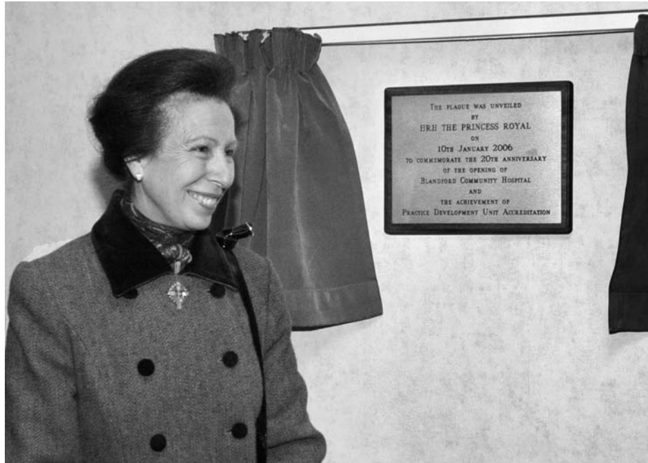
The Princess unveils the Plaque.